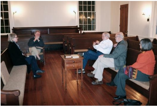
Worship and Ministry meets