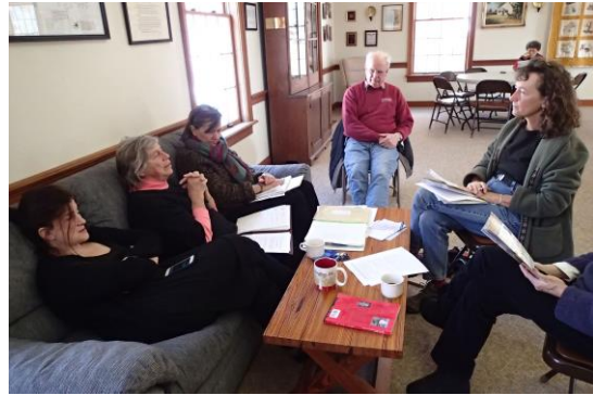
Testimony and Concerns ponders

and thanks to the ever popular Hospitality Committee!