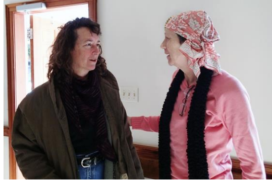
Happy recovery and return!