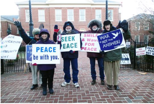
P.E.A.C.E. Vigil for peace in all weathers