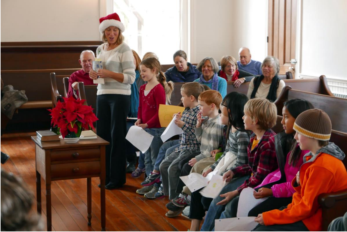
First Day School leads us in thought and song.