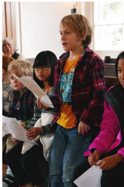
Children’s wishes for Christmas and Third Haven Friends