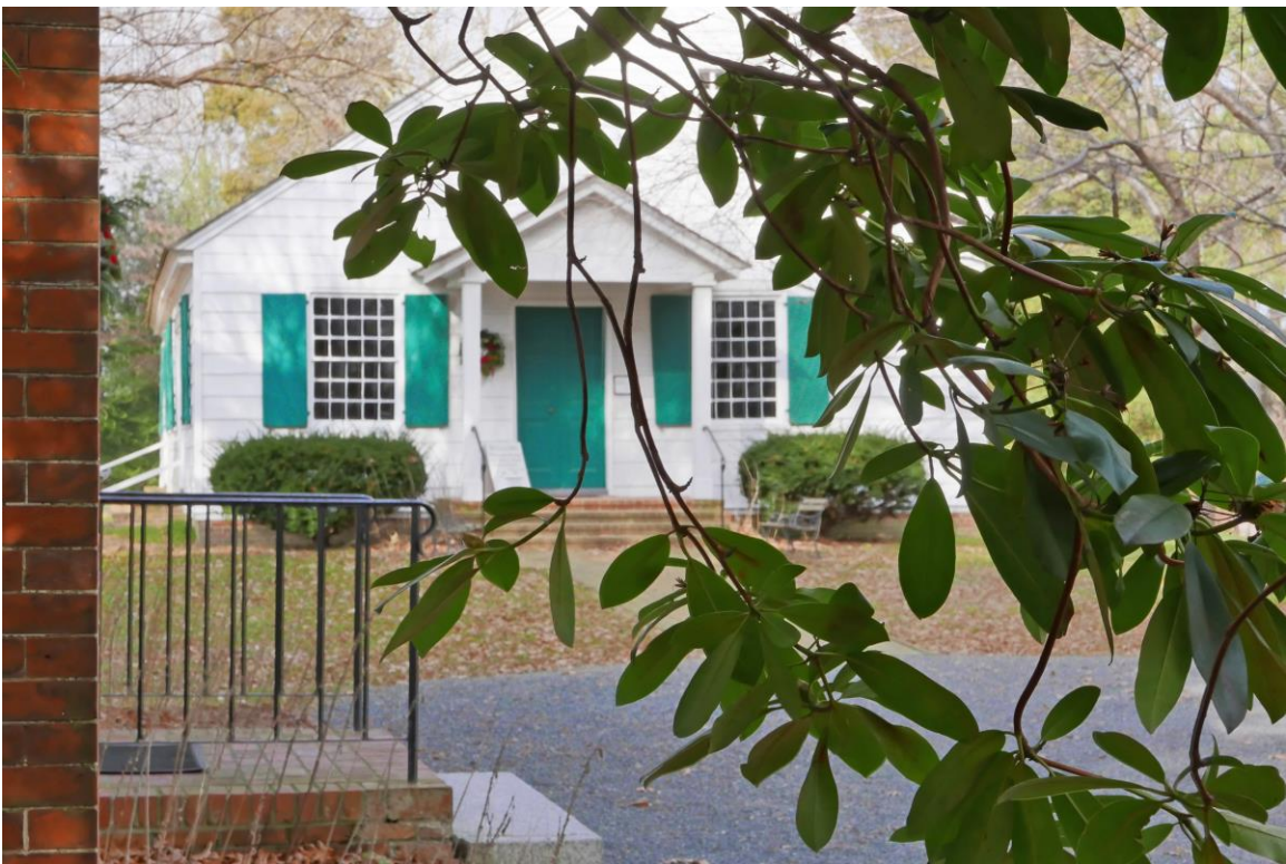
Peace on Earth, Good Will Towards Men