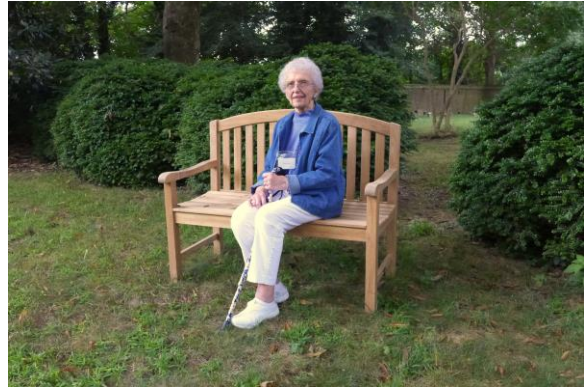
Hooray, new benches, thanks to an anonymous donor.