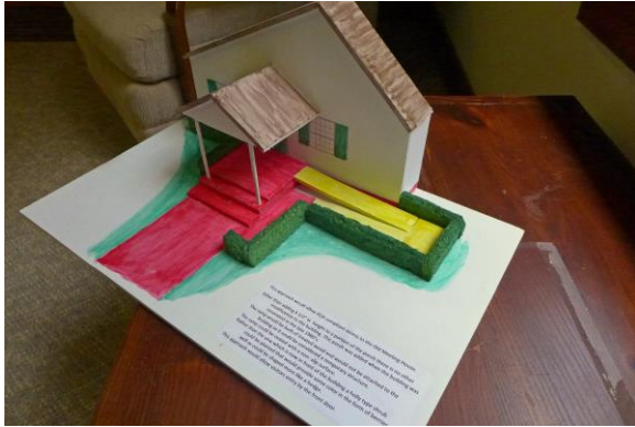
Ramp plan model for viewing